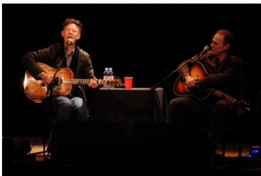
Lyle Lovett and John Hiatt performing live at the Michigan Theater on Monday night, January 31.

Posted: Jan 31, 2011 at 11:54 PM [Jan 31, 2011]