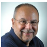
By: Roger LeLievre Freelance Entertainment Writer